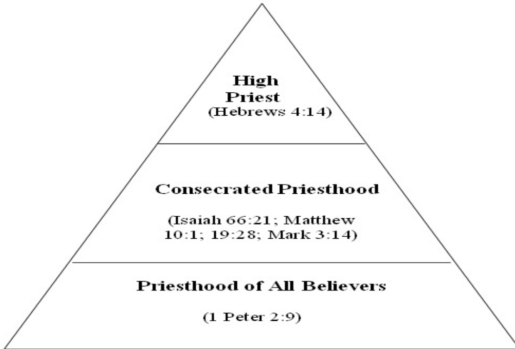
Figure; Levels of Priesthood