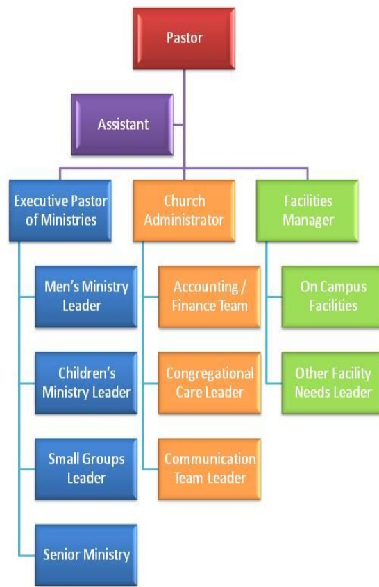
Figure; Duties of Pastor